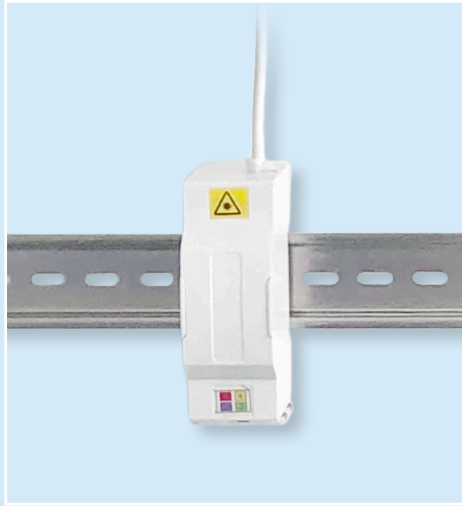
TEN-FW07 supports both wall and DIN rail mounting