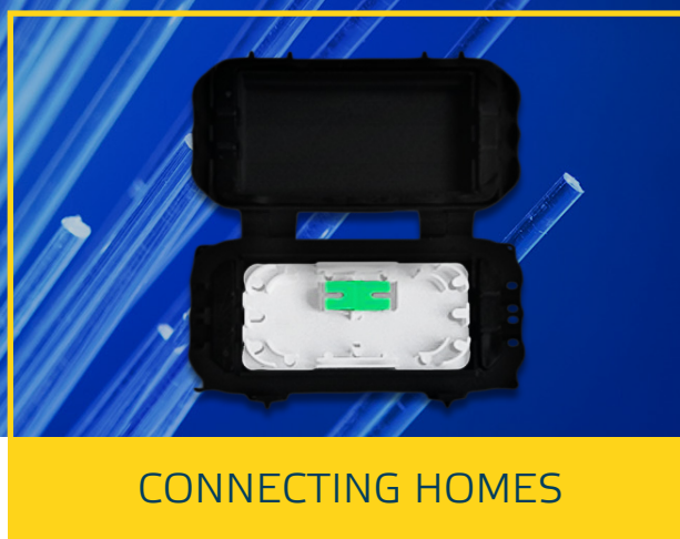
IP68 customer connection enclosure