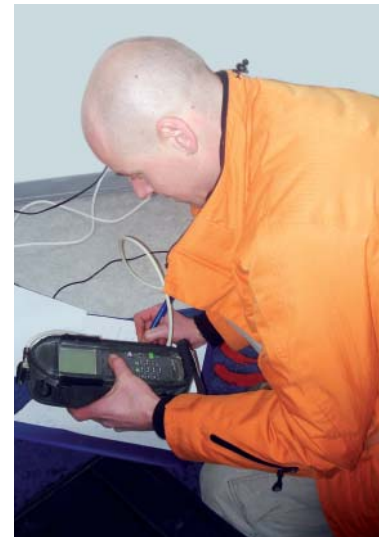
We provide all services required for carrying out successful network projects – from network design right down to measuring and documenting signal levels at end user premises..