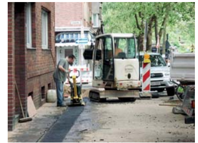
Successful realisation of FttX projects requires coordination and management of civil works teams, an integral part of Teleste's service offering.

Teleste works closely with its customers to deliver complete FttX-projects, all the way from pre-studies to connecting subscribers to the network. Projects are tailored to meet customers' specifications, budgets and timelines. Our references include large scale backbone projects, mobile backhaul applications, FttB, and pure FttH. Whether the project is a metropolitan area or a rural landscape, we understand local regulations and can deliver successful network projects - together with our customers.